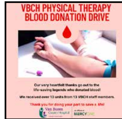
Blood Drive Sponsored by Physical Therapy