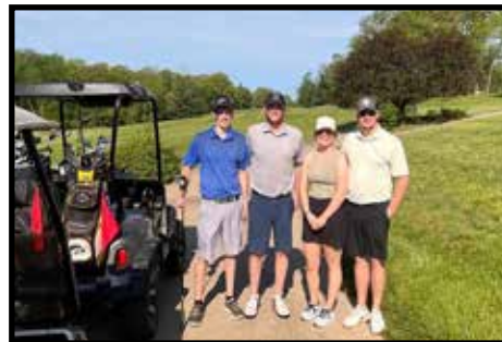
Keosauqua Fire Department Golf Fundraiser