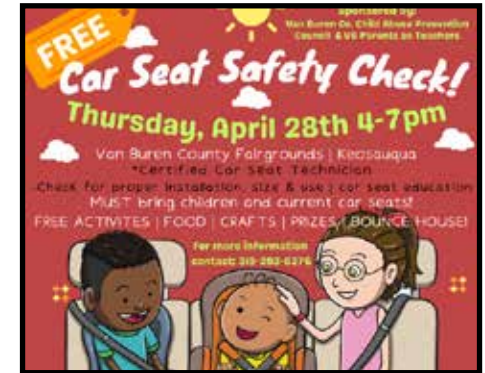
Parents as Teachers Car Seat Safety Checks