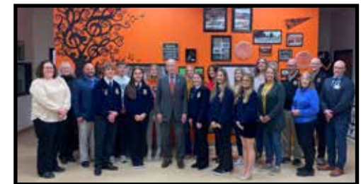
CEO, Garen Carpenter meets with Senator Grassley