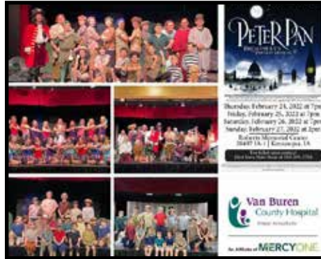
Peter Pan -Van Buren Players Sponsor