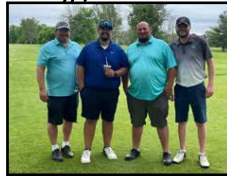
Libertyville Savings Bank Golf Fundraiser Supporting Youth Sports