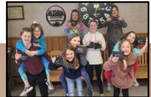
First Aid Kits for VBC Extension Council